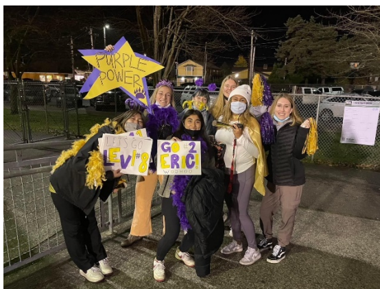
Above: FHHS students cheering on the soccer team.