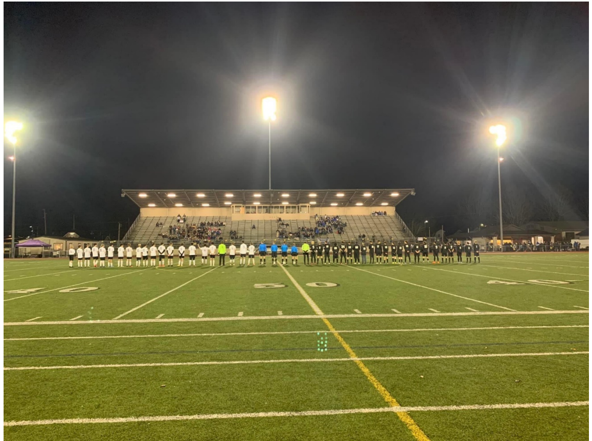
Congratulations to the girls and boys soccer teams for making it to the state playoffs. Girls finished 2 nd in their league and boys finished 4th in state playoffs.